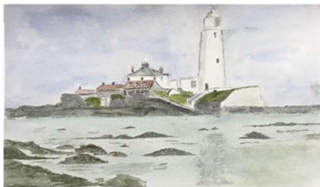
St Mary's lighthouse, Whitley Bay by Graham Seymour

These two seascapes show very different styles and use of colour. The lighthouse has an ethereal feel with use of a limited palette whereas the coastal painting shows a bolder and modern approach.