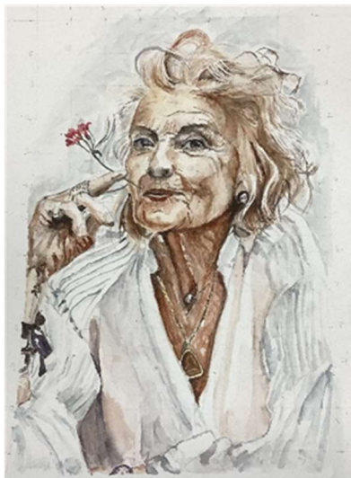
Watercolour by Emma Wilkinson

These two seascapes show very different styles and use of colour. The lighthouse has an ethereal feel with use of a limited palette whereas the coastal painting shows a bolder and modern approach.