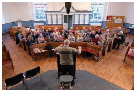
Choir rehearsal, April 2025

We sing to share our feelings, to show solidarity, to soothe, or just entertain. Songs – whether choral pieces or top 40 hit songs – express our feelings. What it’s like to be in love. Our greatest hopes and deepest fears. Singing