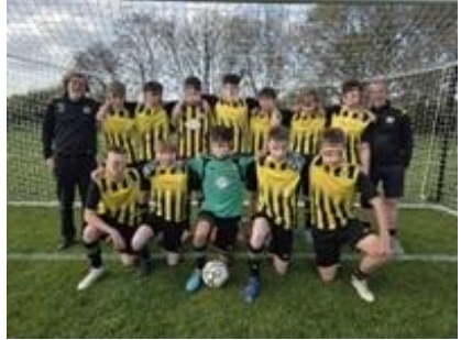
West Hill Wasps U16 team

A regular update is long overdue. The 2025/26 season is now drawing to a close in a frenzy of matches with some teams trying to squeeze half a season's fixtures into a month after a very long period of waterlogged pitches. All our sides have experienced the highs and lows of winning and losing and results are less important than the enjoyment and lessons the children get from playing as a team but our U15s are having a particularly